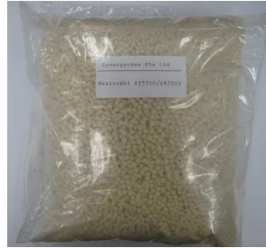
Photo of sample

Sample description : Maxicombi AT3300 / AR3303